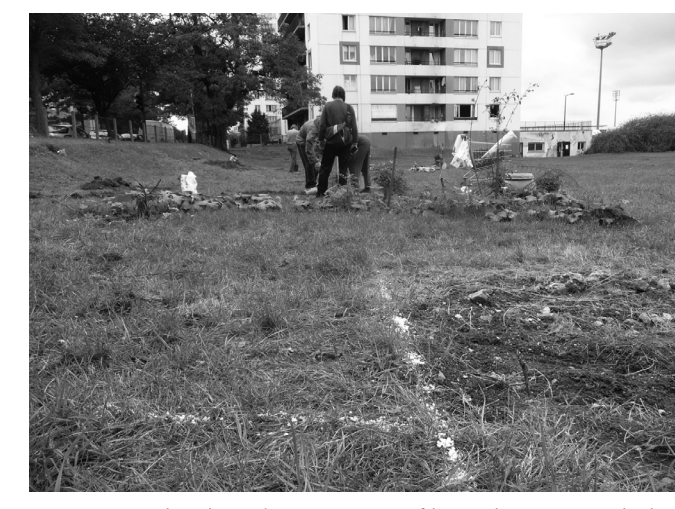
PLOT TRACING within urban gardening initiative, part of the R-Urban strategy in Colombes

These prototypes allowed us to experiment with simple methods of implementation of an ecological approach at the level of everyday life and to generate self-managed collective use and environmental practices. We are preparing the construction of the first R-Urban pilot projects, which will implement resilient practices in a neighbourhood in Colombes. A social economy cluster and organic food market will be initiated in connection with urban agriculture plots. A recycling unit that will process construction materials and co-operative housing built from these